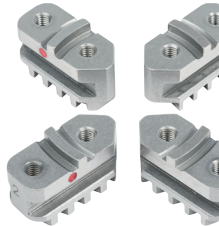
Discovery GK88 Accessory Mounting Jaws - Code 106817

To remove the mounting jaws, first remove the safety screw A .